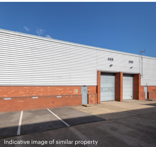
Indicative image of similar property