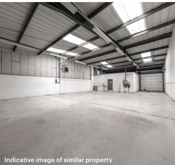
Indicative image of similar property