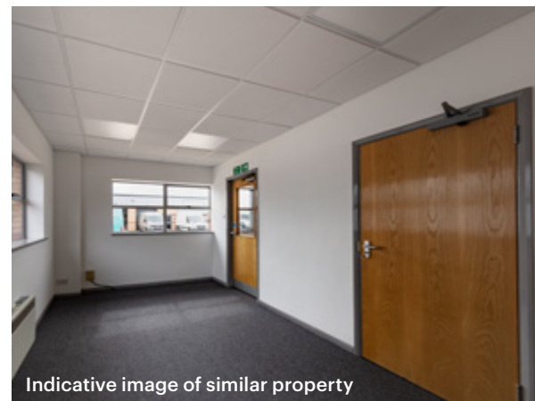
Indicative image of similar property