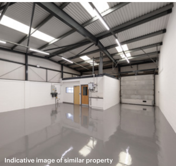
Indicative image of similar property