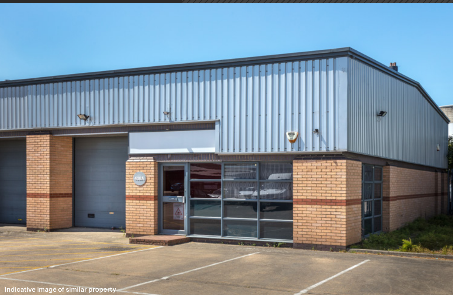
Indicative image of similar property

Available to let Single storey warehouse / industrial unit 1,520 sq ft (141.3 sq m)