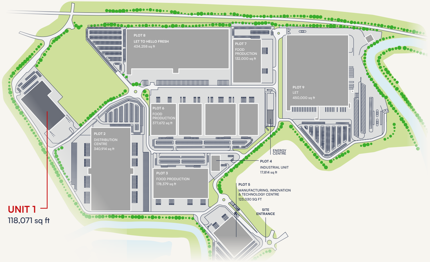
UNIT 1 118,071 sq ft