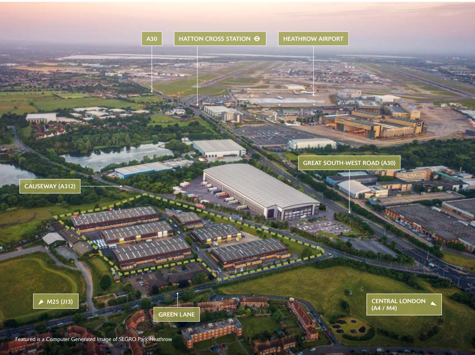
Featured is a Computer Generated Image of SEGRO Park Heathrow

INDUSTRIAL / WAREHOUSE UNITS IN A PRIME HEATHROW LOCATION