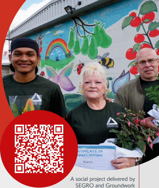
A social project delivered by SEGRO and Groundwork

We deliver community investment programmes in the areas where we operate to ensure our schemes benefit local people, particularly those in need of extra support. This involves partnering with local groups and interests to identify, fund and deliver different educational, employment and environmental initiatives. Scan the QR code to the right, to learn more about our community outreach.