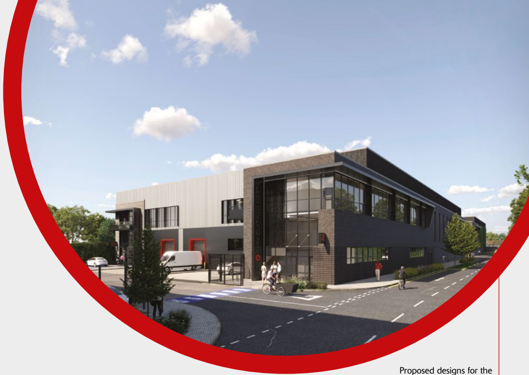
Proposed designs for the industrial park, looking north along Timber Mill Way

In the warehouses, translucent panels have been added and will be located at heights that restrict people's ability to overlook into residents' homes. They will also remove the need for artificial lighting, helping to reduce the energy demands on the industrial park.