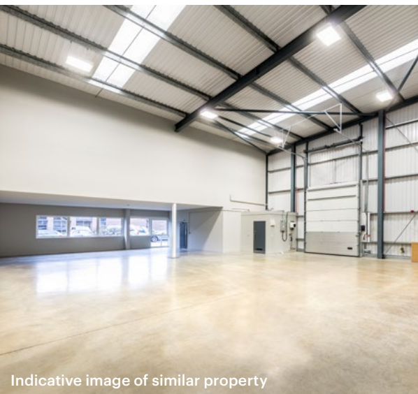
Indicative image of similar property