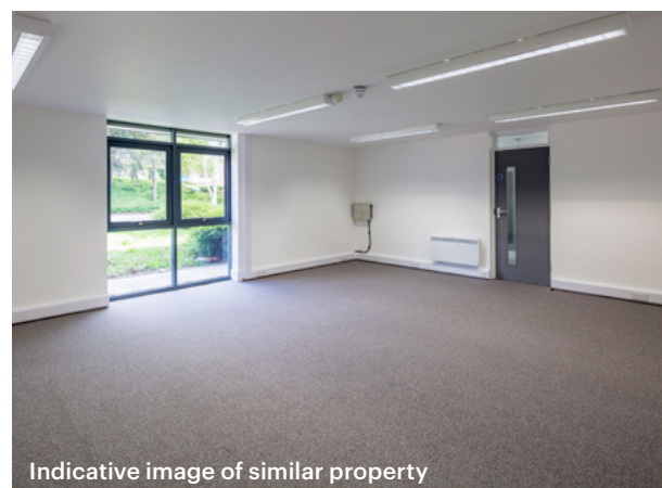
Indicative image of similar property