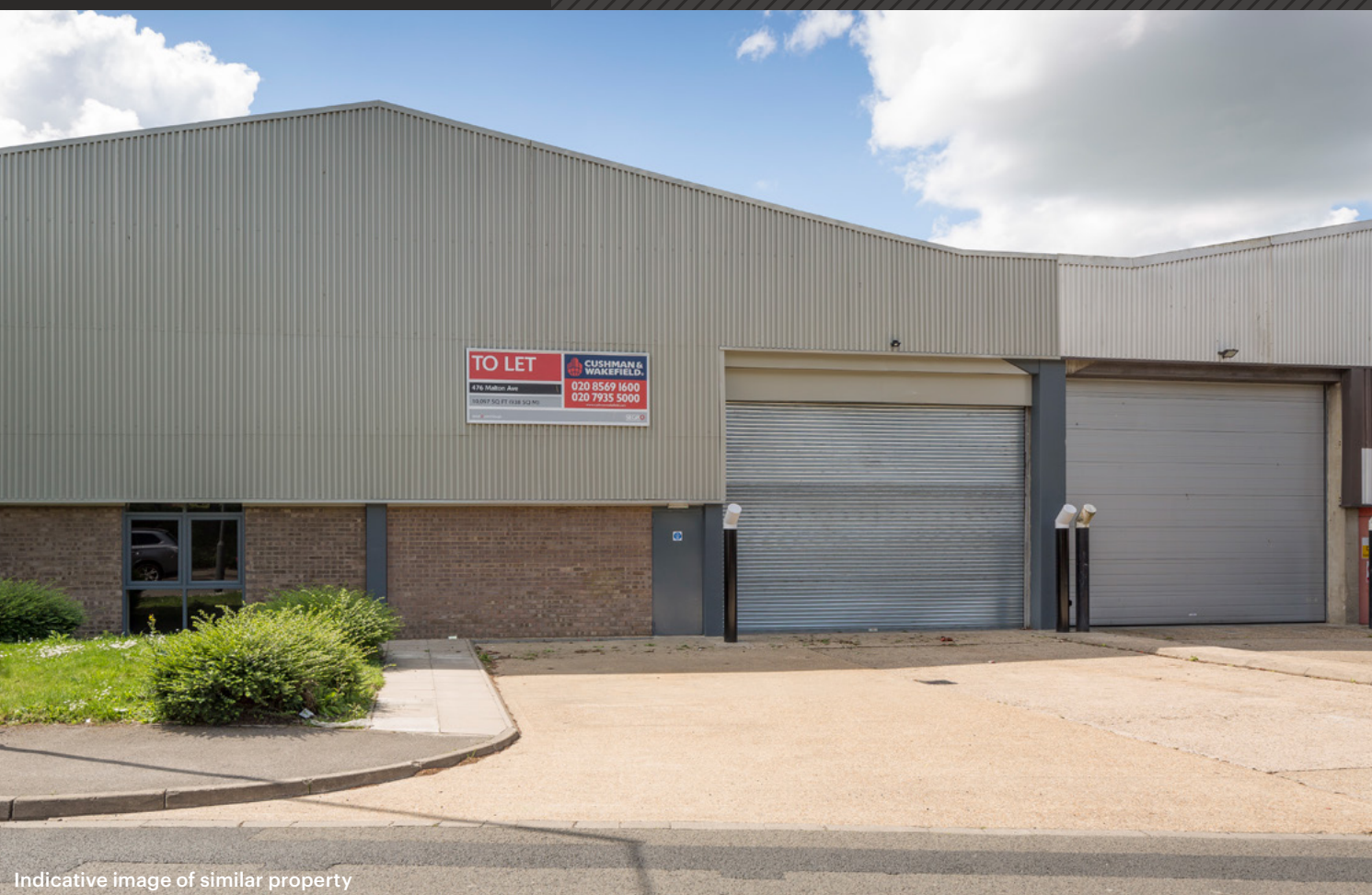
Indicative image of similar property

Available to let Single storey warehouse / industrial unit 6,468 sq ft (600.9 sq m)