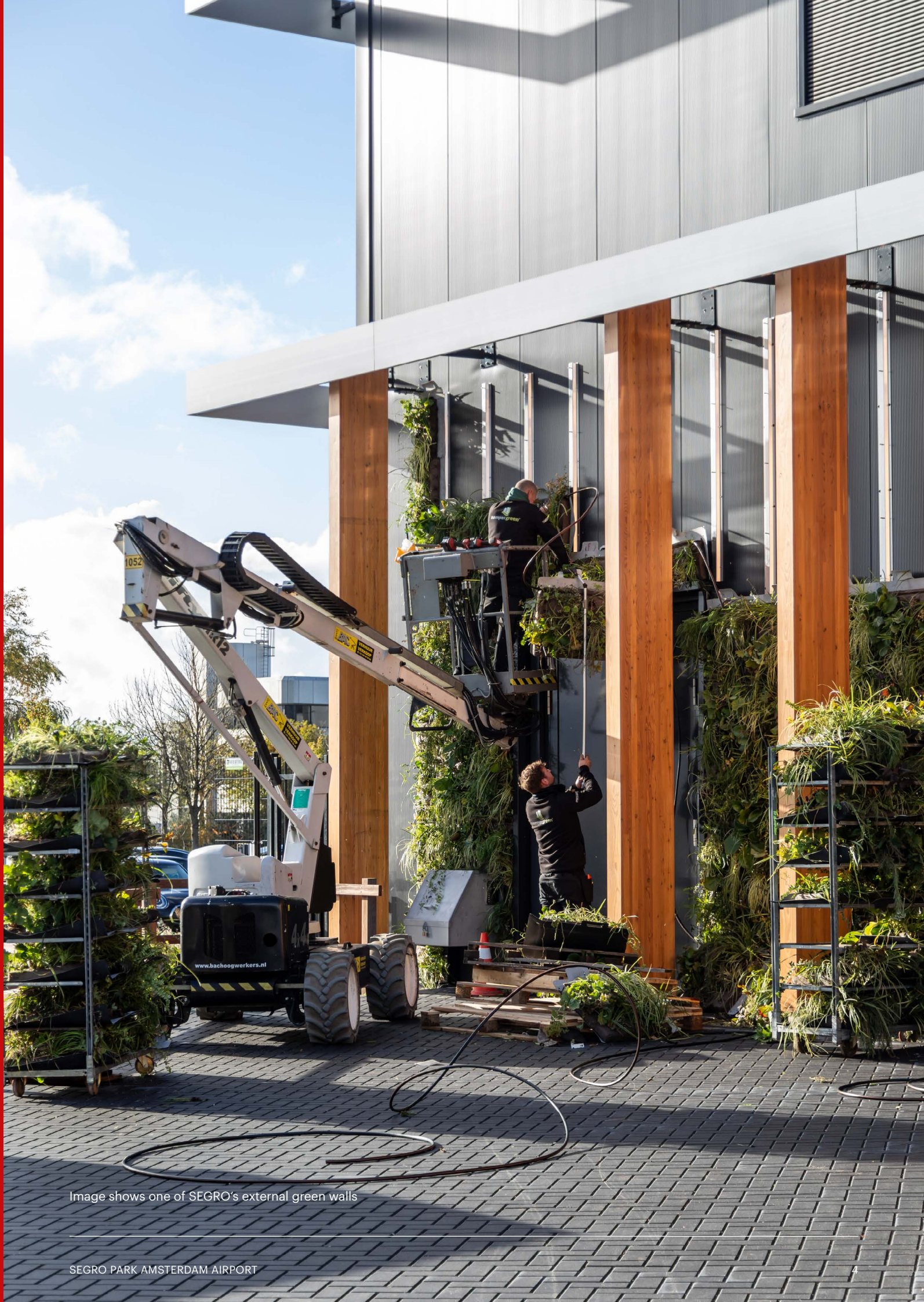
Image shows one of SEGRO's external green walls

The N201 provides access to Amsterdam airport in less than 10 minutes.