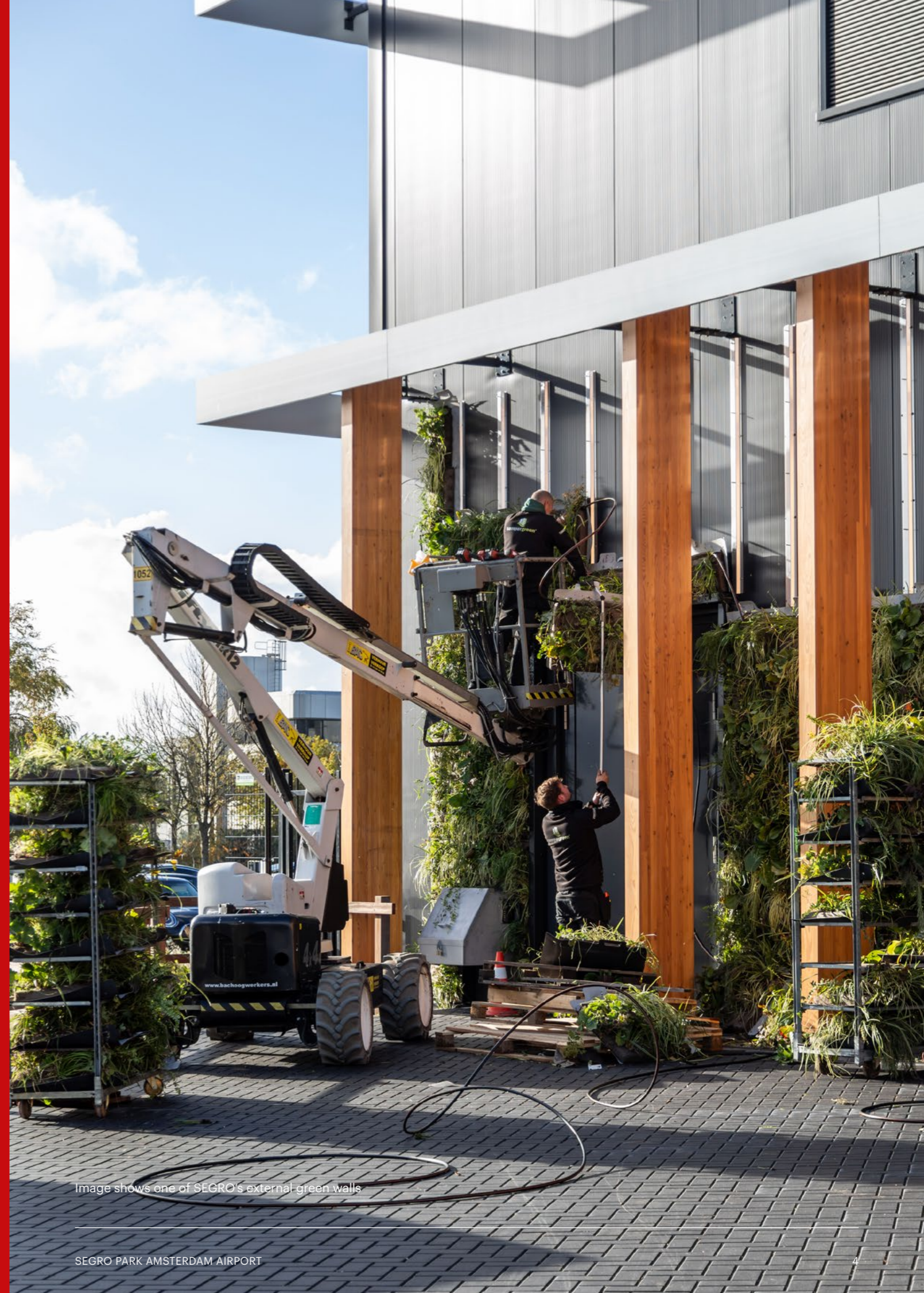
Image shows one of SEGRO's external green walls

The N201 provides access to Amsterdam airport in less than 10 minutes.