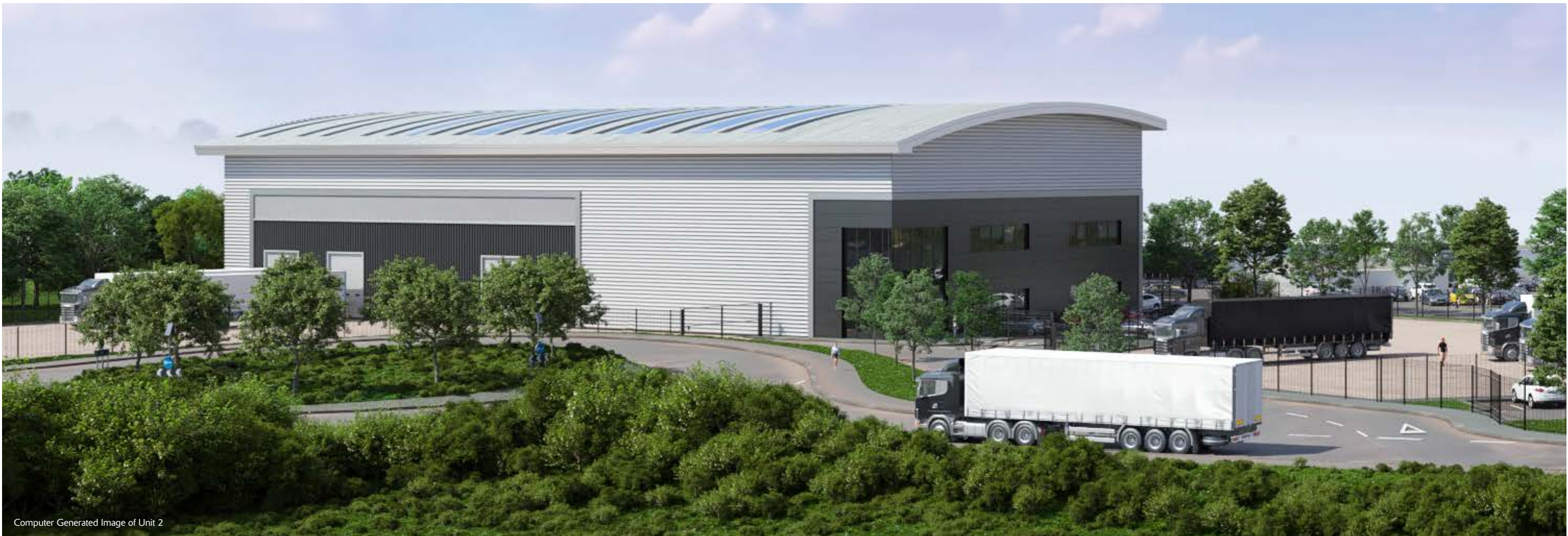
Computer Generated Image of Unit 2