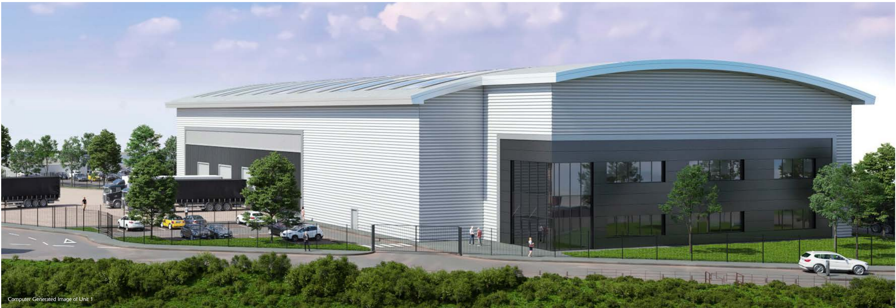
Computer Generated Image of Unit 1